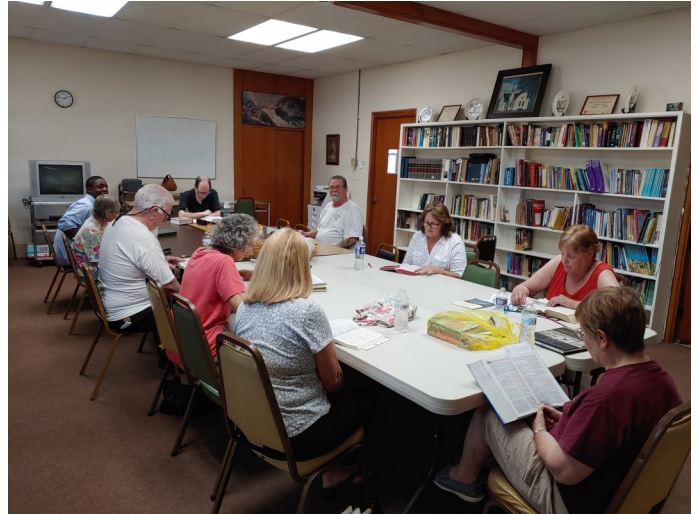
Monday Afternoon Bible Study

While you can tell from this picture that the group actually does study the Word, they have a good time together, too!